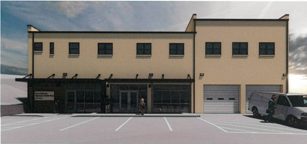
Rogue Street Facade