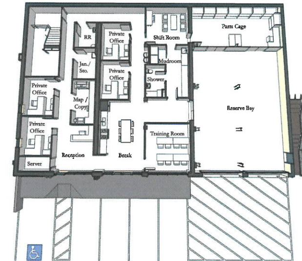
Lower Floor - Public Works Facility