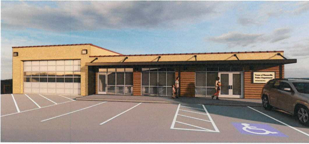
Main Street Facade